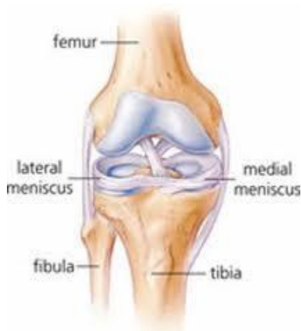
Figure 1. The Knee Joint

The menisci are thick pads of cartilage tissue within the knee which act as shock absorbers to absorb body weight and help improve smooth movement and stability of the knee. Each knee joint contains a medial and lateral meniscus (inner and outer meniscus).