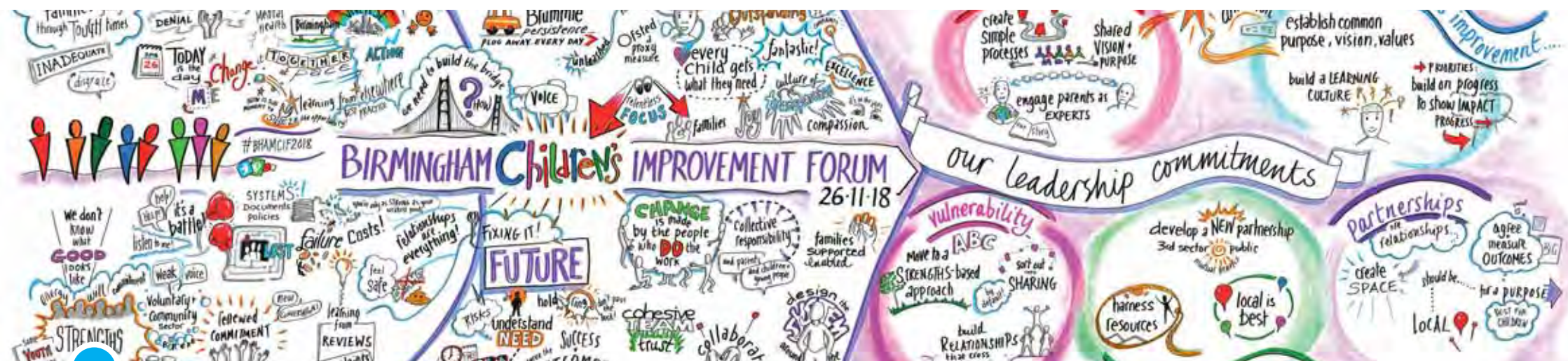
Figure 1. The finished illustration which encapsulated the day.

Copies of the finished work will be made available to all delegates and will be a vibrant reminder of how everyone had contributed to a challenging and successful Improvement Forum.